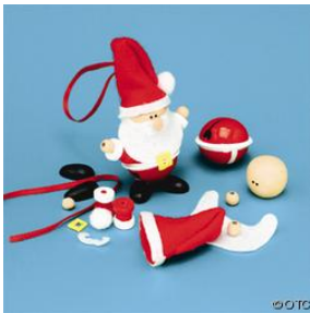
Jingle Bell Santa Ornament Craft

The Third Annual Santa's Workshop and Craft Fair is coming soon. Come and make fun and wonderful crafts to give as gifts. There will be a variety of vendors throughout the school to get your Christmas shopping started! We will even have a special visit from Santa with photo opportunities. Complete the form below by marking the choice and quantity of each craft that your child would like to make. Send in your form with total payment for each craft by Dec. 2. Please make the checks payable to White Oak PTO.