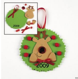
2009/2010 Reindeer Ornament Craft