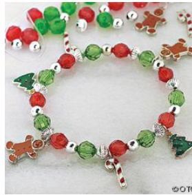
Holiday Charm Bracelet Craft