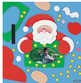
Santa Photo Magnet Craft