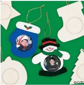
Hand painted Wood Photo Ornaments