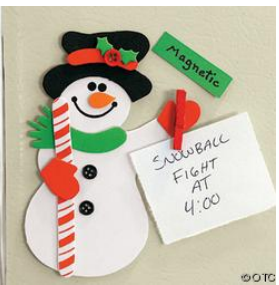
Magnetic Snowman Note Clip Craft