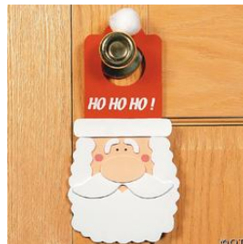
Foam Santa Door Hanger Craft