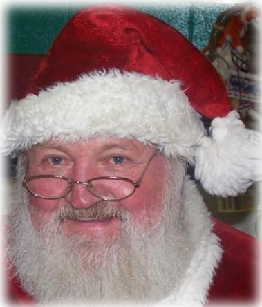
Photo with Santa

Don't miss the chance to have your picture made with Santa!